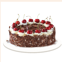
Black forest cake (SchwarzwälderKirschtorte) German

In China, long noodles symbolise long life. It is thought bad luck to cut the noodles when cooking them and good luck to eat them without biting through them.