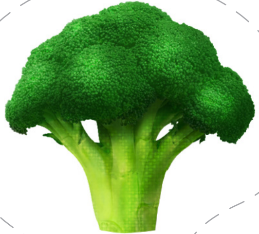
ब्रौकोली brāūkoli Broccoli