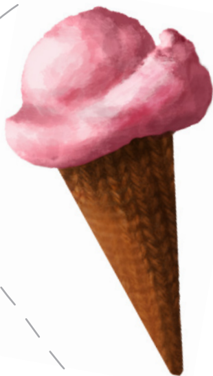
冰淇淋 bīngqílín ice cream