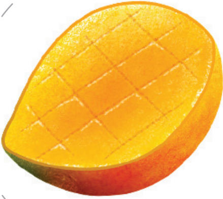
आम ām Mango