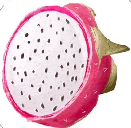
火龙果 huǒlóngguǒ dragon fruit