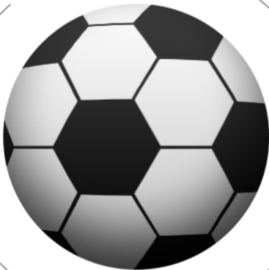
El fútbol Soccer