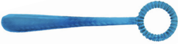
泡泡 pàopao bubbles