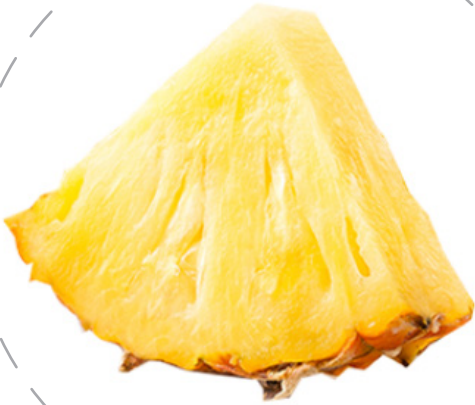
La piña Pineapple