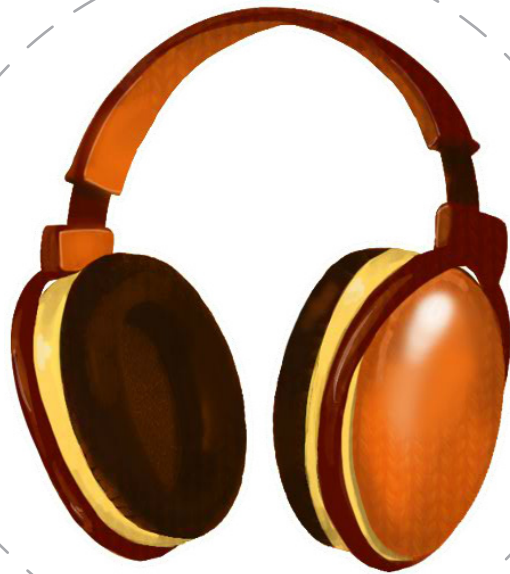
音乐 yīnyuè music